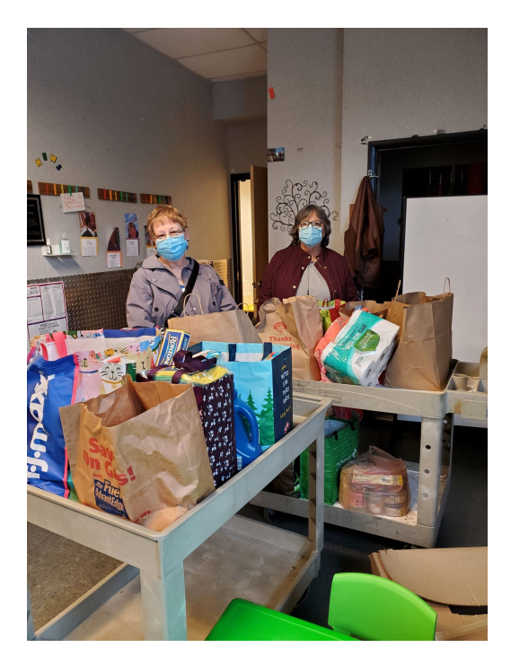
Thank You Letters

Our contributions to The South End Children's Café totaled 20 baos full of food items, toilet paper and laundry detergent. A special thanks to all members for their generosity and support.