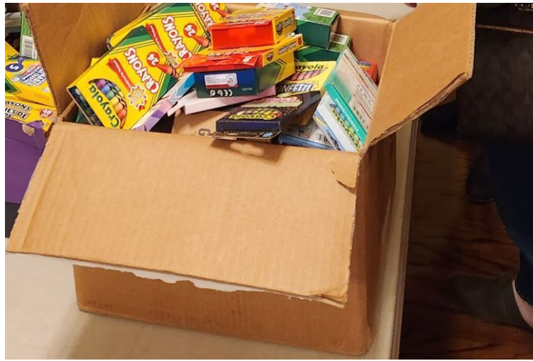
Talk about holiday spirit! Members and guests at November Member Monday put together friendship bracelet kits and coloring book/crayon kits for the pediatric unit at Albany Medical Center, using materials donated by WCA members.