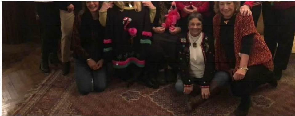
2019 "Ugly Sweater/Worst Gift" 2sDay in the Parlor