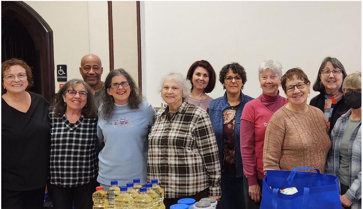
Several WCA members packed 85 holiday food bags for the Focus Interfaith Food Pantry. Items packed included boxes of cake mixes donated by WCA members at October Member Monday.