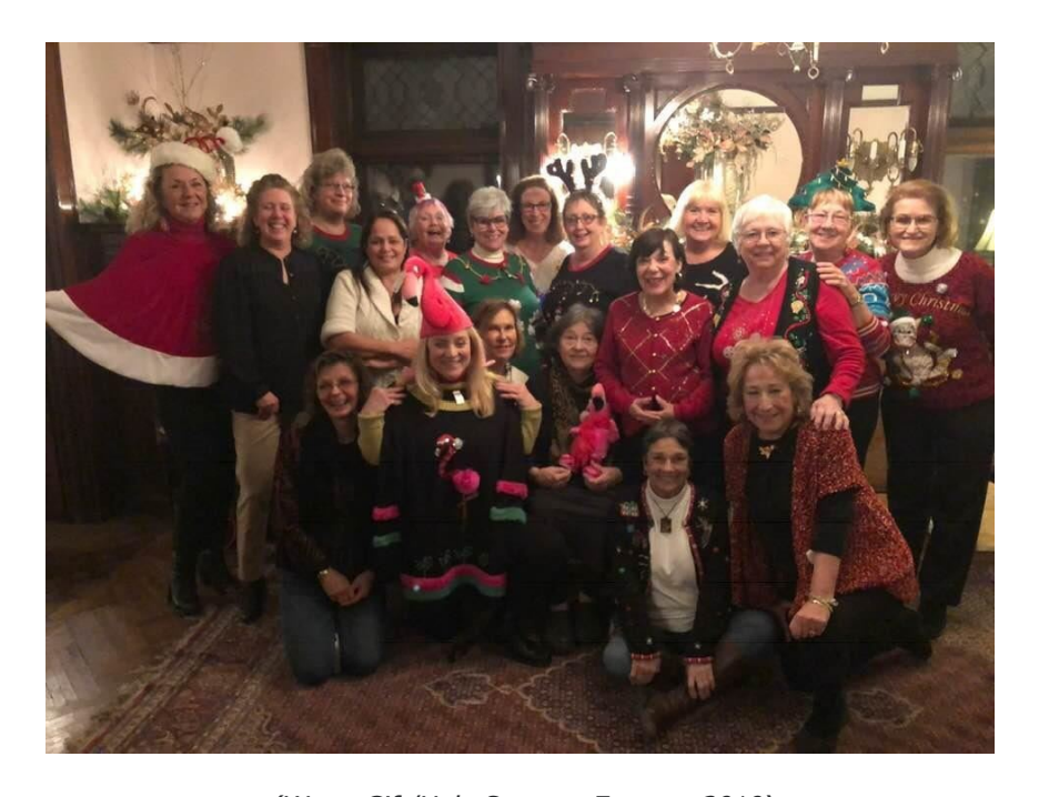
(Worst Gift/Ugly Sweater Event -- 2019)

Please bring a nip or a nosh to share -- and bring a friend. It's always fun on the porch -- the Best View on Madison Avenue!