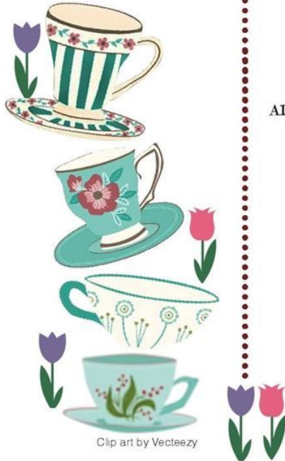
Clip art by Vecteezy