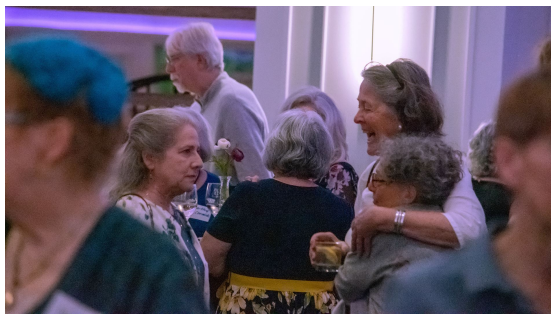
WCA members and guests enjoy the festivities.